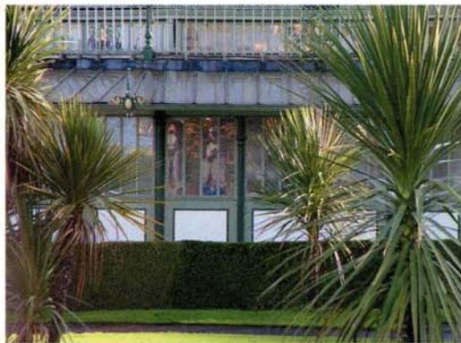
▶ Winter Gardens in Brasil

red velvet and gold, hanging from iron columns. It is a place rich in the absurd where merchants and landowners could indulge in a taste of Europe, acoustically, thermally and socially removed from the ruthless exploitation of human labour and natural resources. It is another chapter in a tale of iron and accumulated labour time that connects Brasil, Africa and Europe in a geographically immense circuit of capital. Timber felled locally was shipped back to France for finishing. Clothes and textiles, vital for a theatrical experience, were sent to London for tailoring and pressing. And the hands of Possil ironworkers and Amazonian rubber tappers can be found at each stage of the journey, a trail that begins with the smelting of iron and terminates on the bicycle tyres of workers, wheeling their way to the Saracen foundry. ◀